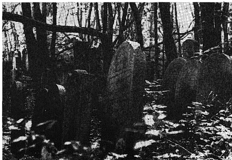
A Jewish cemetery on the outskirts of Warsaw.