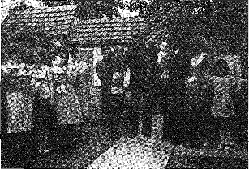
Baptism family in Prokhladny.