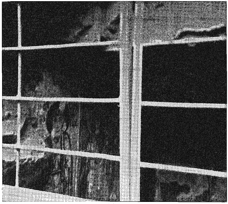
Albania. See article on pp. 268-272.