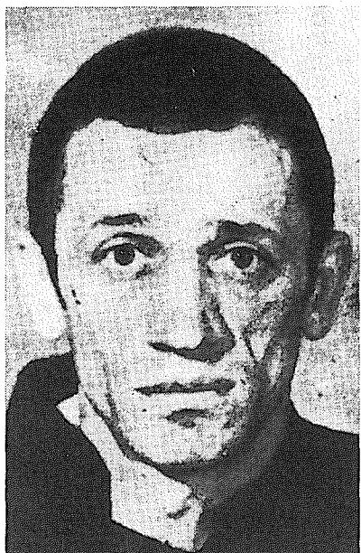
Valeri Marchenko, Catholic prisoner of conscience, who died in October 1984 while serving a ten-year prison term in the Soviet Union. See pp. 77-78. (Photo courtesy Centre for Appeals for Freedom).