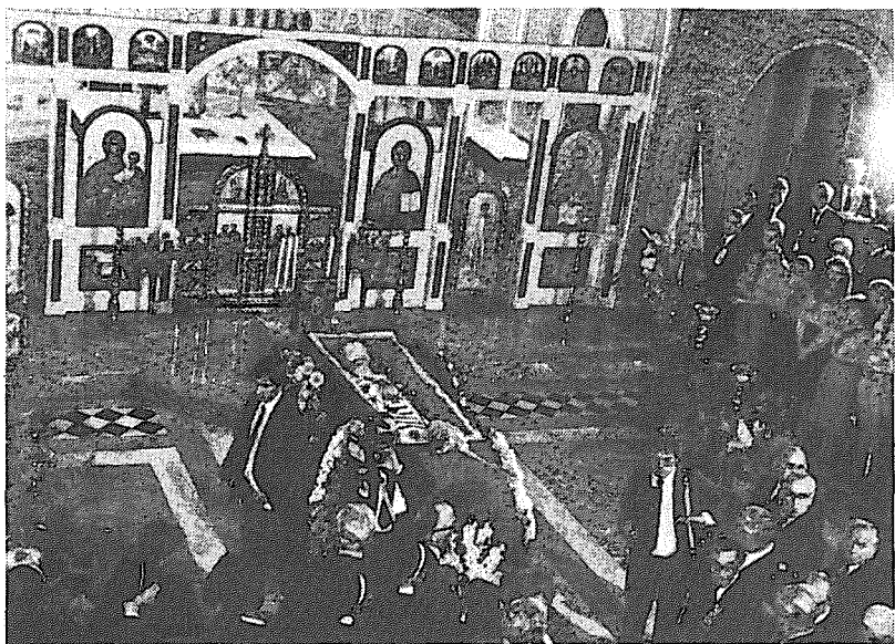
The funeral of Cardinal Slipyj in Rome. Above : the lying-in-state. (Photo courtesy Adrian Jenkala). Below : the funeral mass. (Photo courtesy the archives at St. Sophia's, London). See obituary on pp. 91-93.