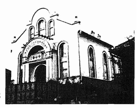
Right: Medias Baptist Church, Romania.