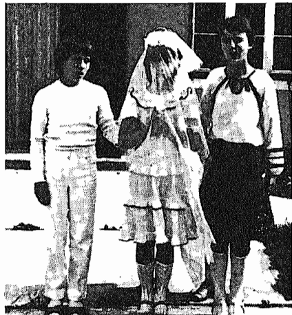
A young Hungarian Catholic girl celebrates her First Communion, May 1983. Despite official discouragement, childrens' attendance at religious instruction classes remains very high in traditionally Catholic rural areas.