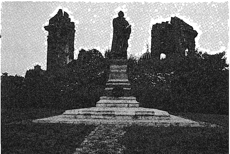
One of the posters on public display to invite guests from all over the world to the Luther Year celebrations in the GDR ( above right): see article on pp. 77-85. Below a statue of Martin Luther, framed by the ruins of the Frauenkirche in the centre of Dresden. The church has intentionally been left unrepaired as a reminder of the wartime bombing which devastated the city.