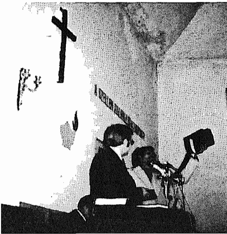
One of the larger provincial congregations of the Free Christians in Hungary ( below and left ). See article on pp. 4-10.