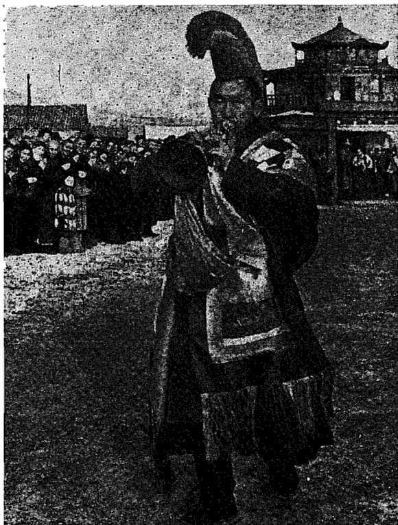
Buryat Buddhists welcome a guest before a Buddhist temple. (See interview pp. 12-16).