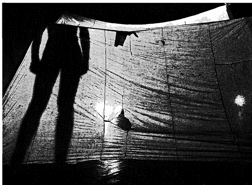
Scenes from student theatre productions in Poland. Polish student theatre has explored major social, political and religious issues (see article pp. 4-8).