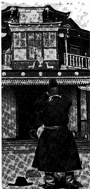
A Buddhist believer in Buryatia worships outside a temple.