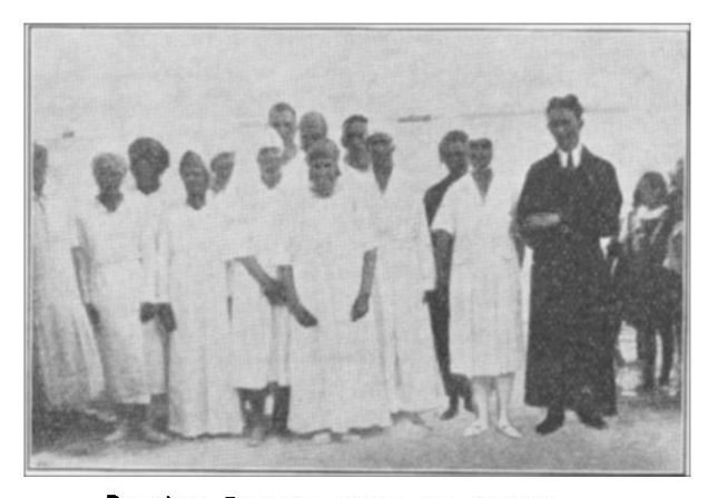
Braintree Believers Ready for Baptism