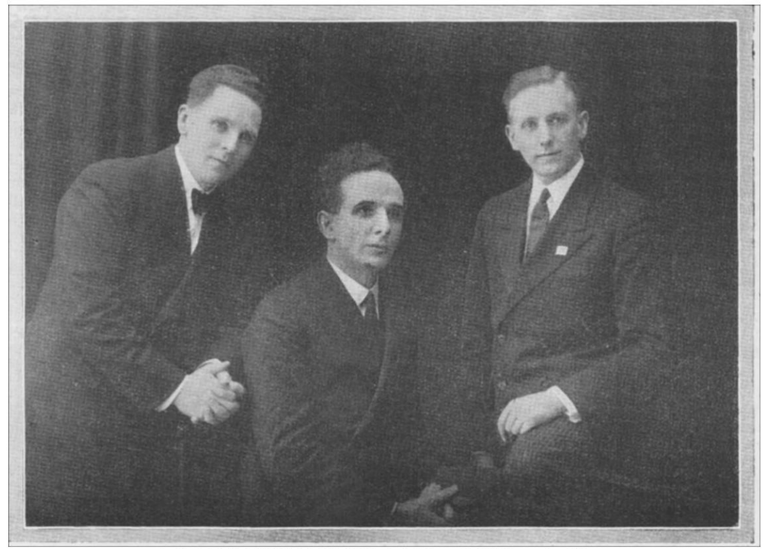
A RECENT PHOTOGRAPH OF THE REVIVAL PARTY

THE procession of the sick moved the congregations to tears. Daily they came—one continual stream—suffering—some given up by doctors who put forth