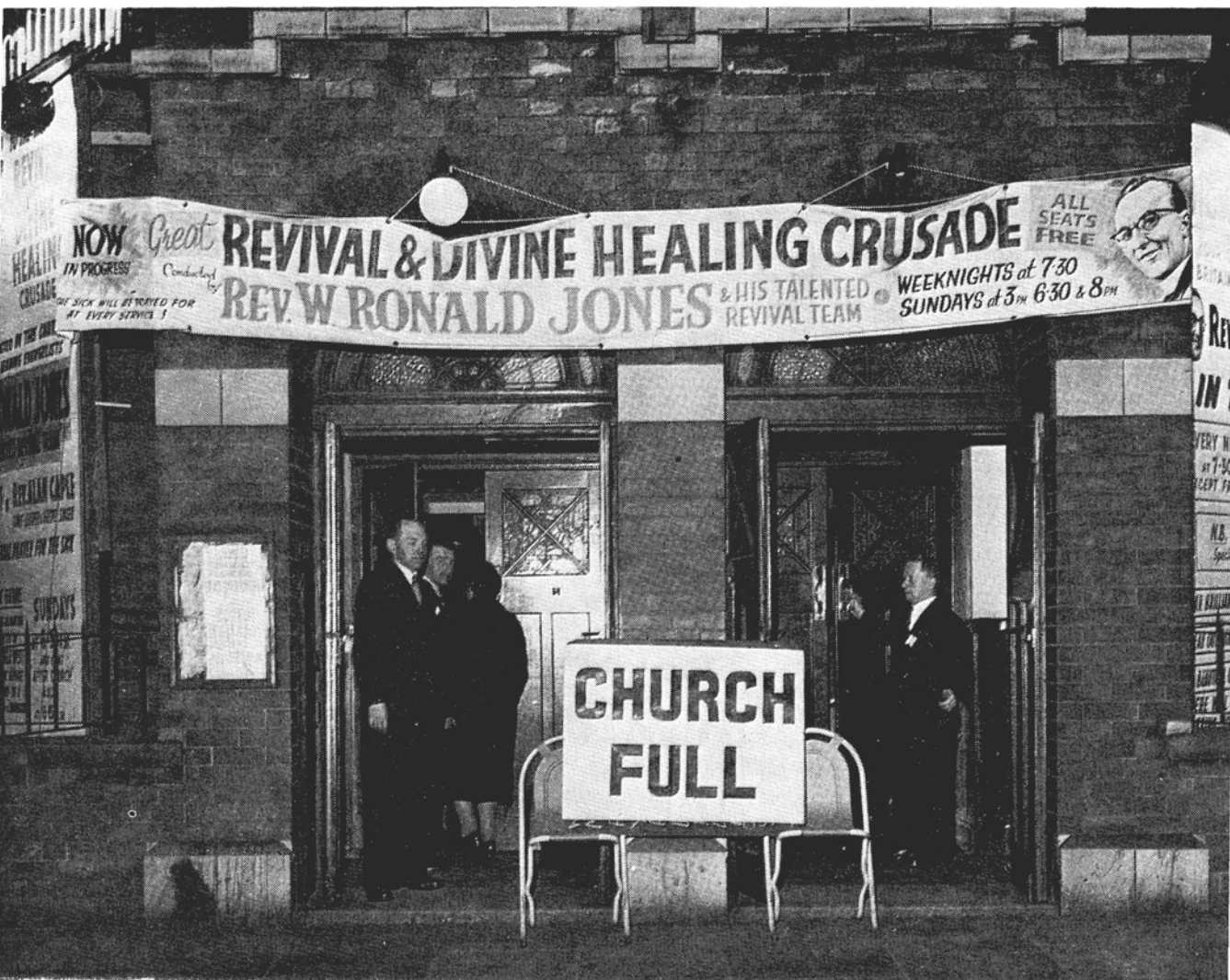
By courtesy of