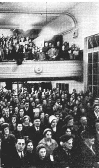
at one of the services.