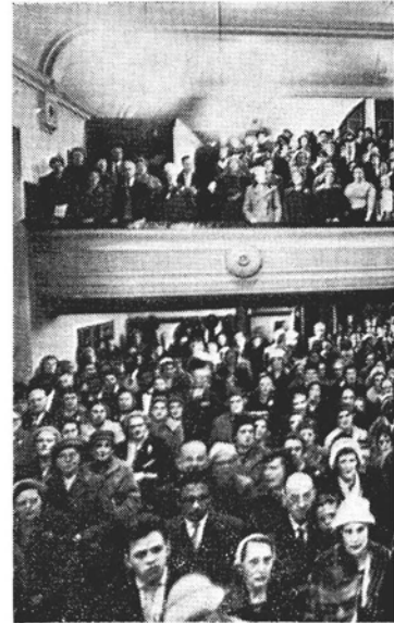
A section of the congregation.