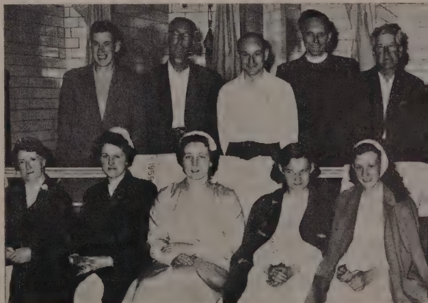
Photos : Top, congregation at crusade in Clydebank Town Hall.