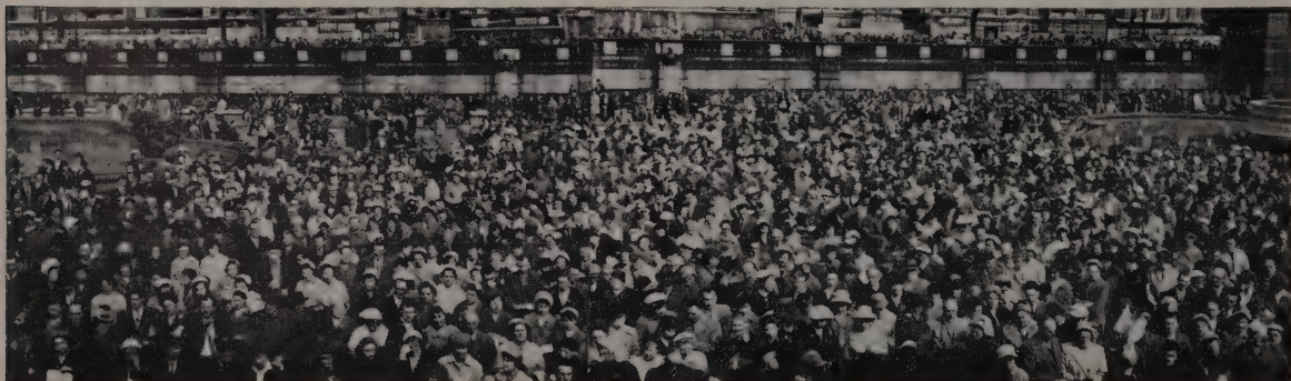
Crowds at Trafalgar Square rally.