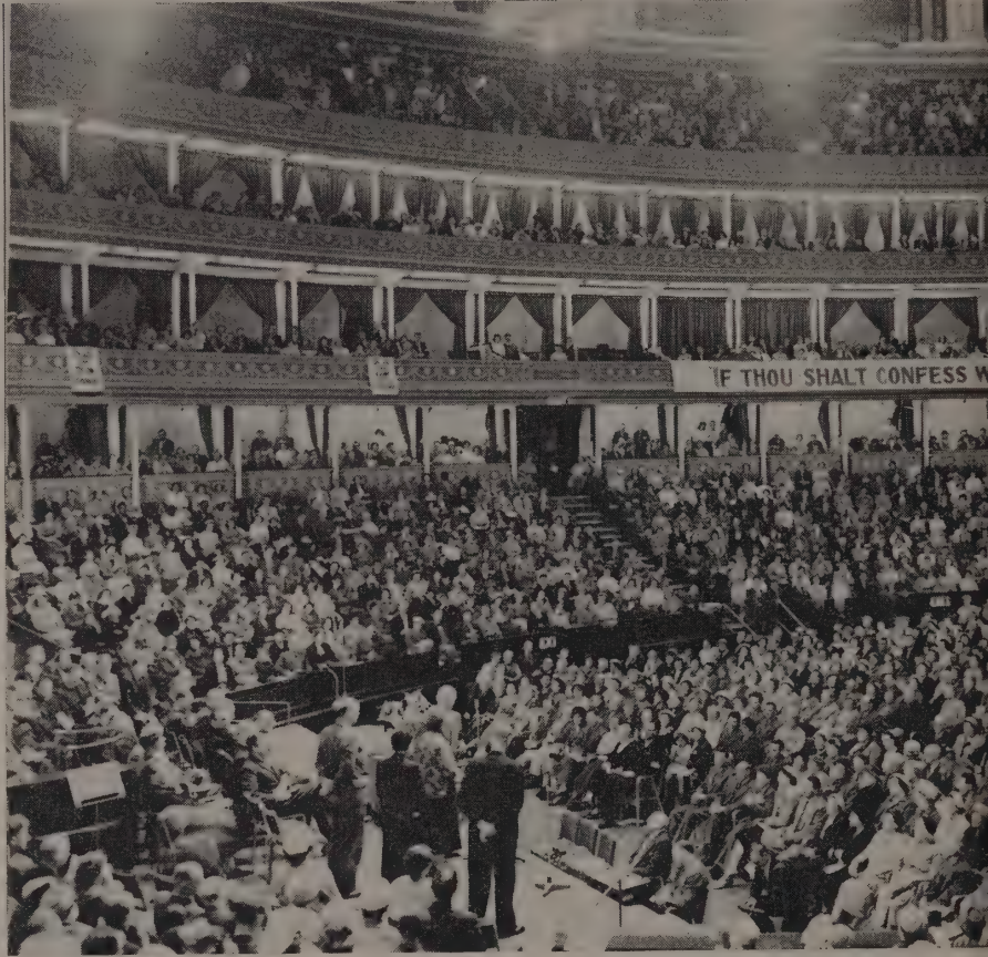
Panoramic view of the great eve

and instrumental were a satisfying reminder of the consecrated talent of Elim youth. Two of the trio had been members of the National Youth Orchestra—a distinction that marked their efficiency.