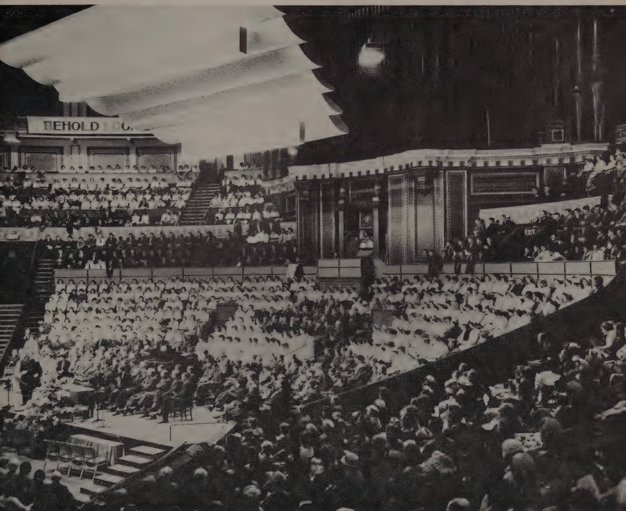
THE SPLENDID YOUTH CHOIR AT ELIM'S EASTER FESTIVAL