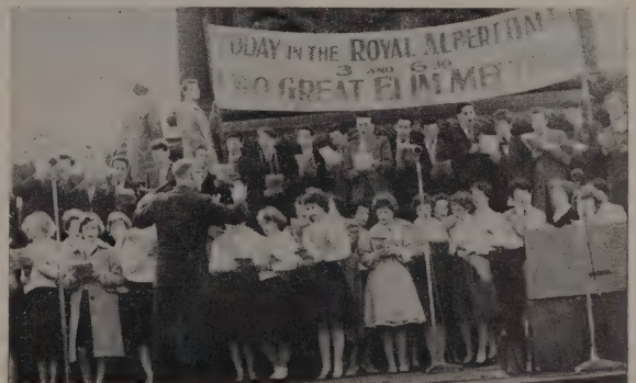
Blackheath Youth for Christ Choir.

He is praying that God will bring these young men to know the Saviour. Will you pray with him?