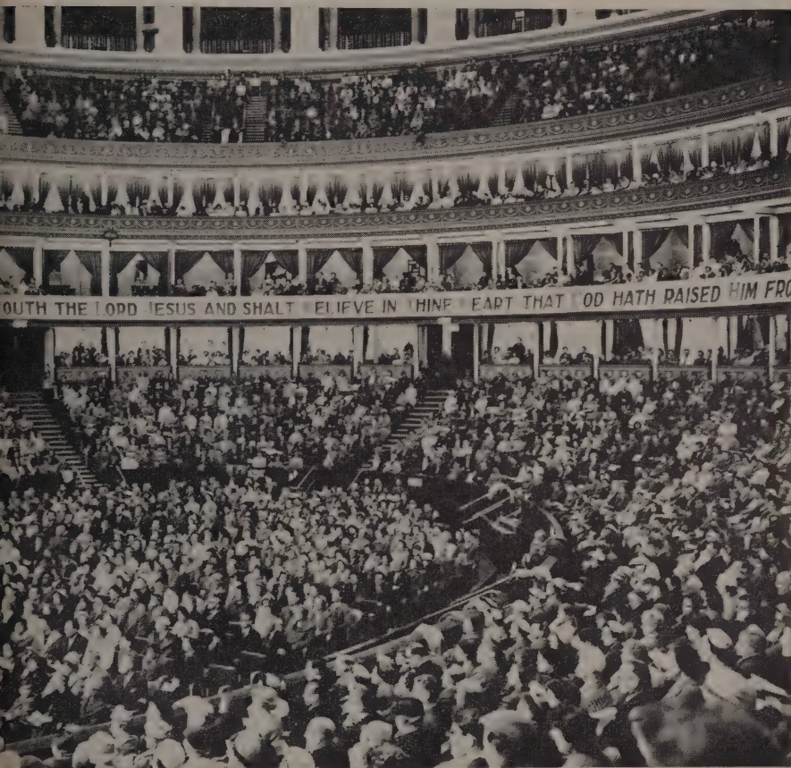
gregation in the Royal Albert Hall.

The President concluded the meeting with the benediction, and then a happy crowd carried its blessing into the sunshine to find that the mournful marchers had moved to