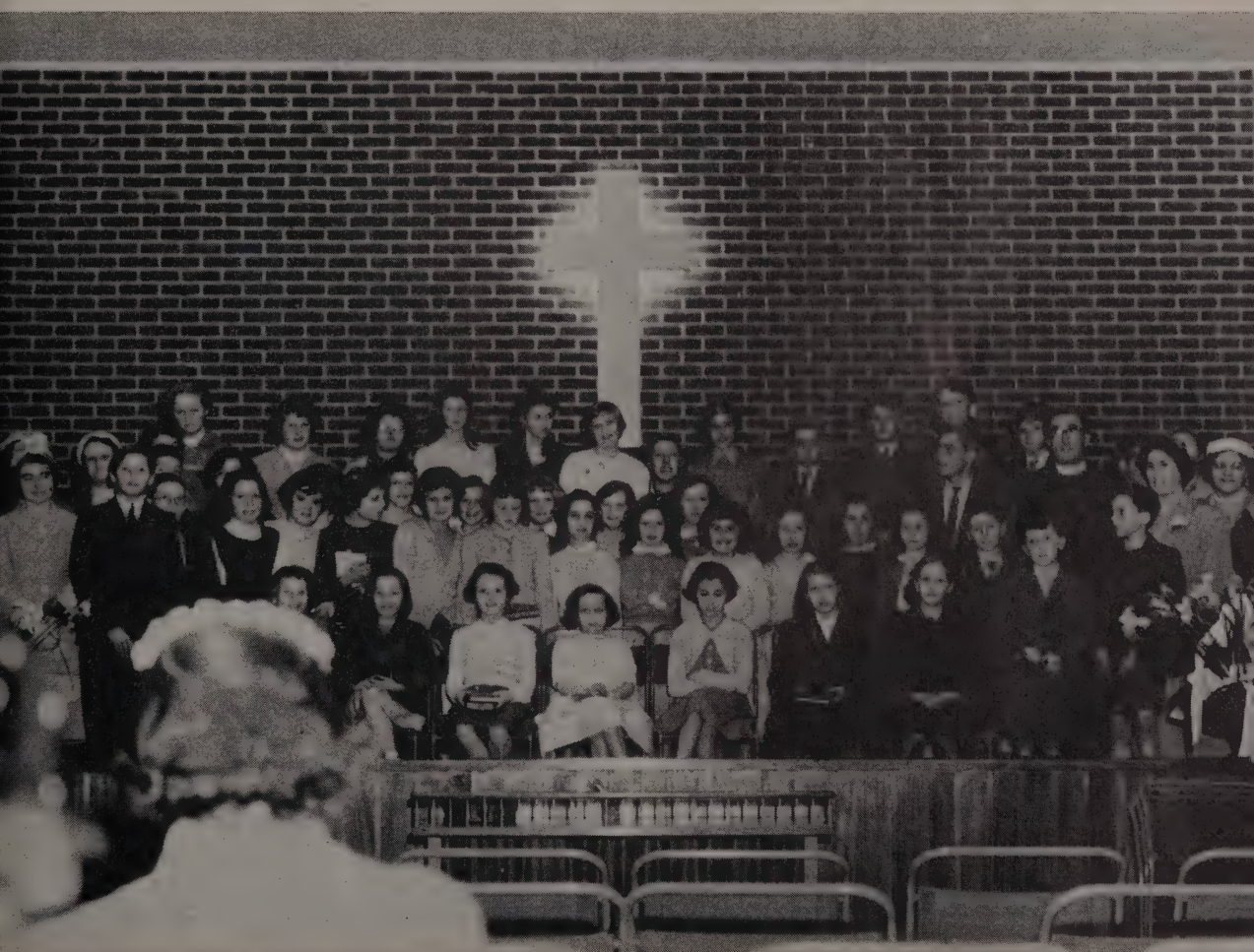
BRISTOL'S FINE JUNIOR CRUSADER BAND