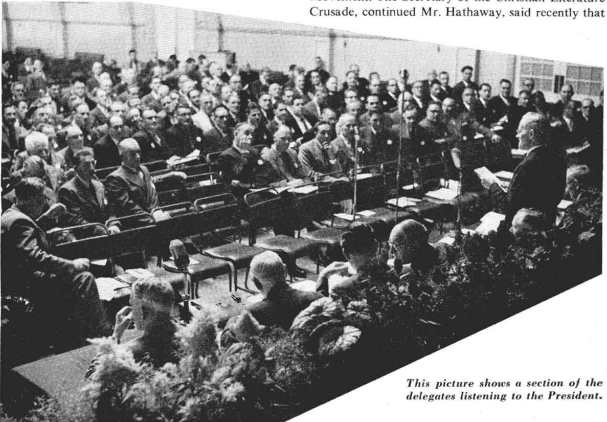
This picture shows a section of the delegates listening to the President.