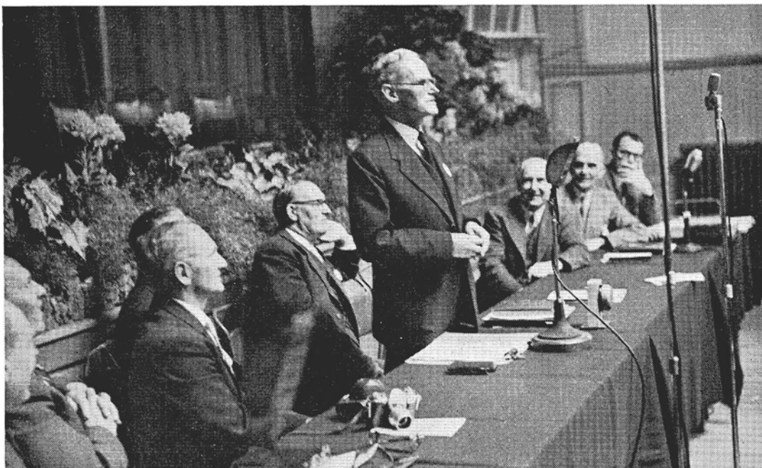
The President thanks conference delegates for their gift on his semi-retirement.

"In his office as Secretary-General, which he held for so many years, his work has for the most part been away from the glare of publicity, but that is