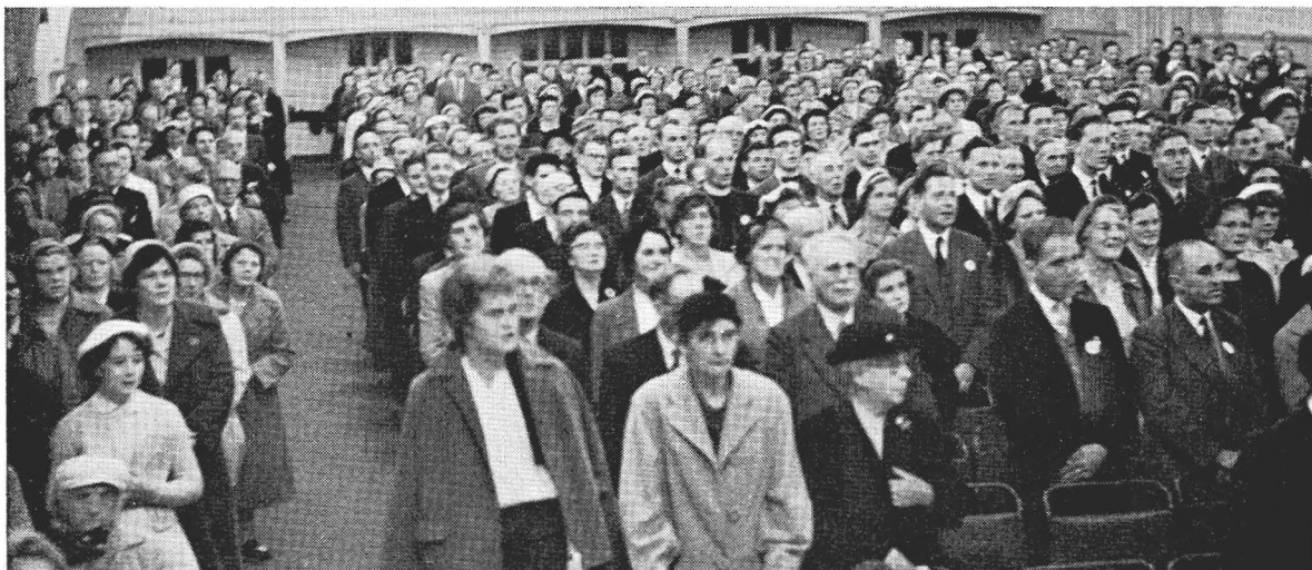
Section of congregation.