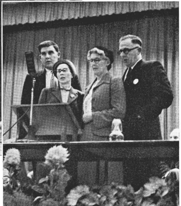
Below: the Bournemouth Quartet.