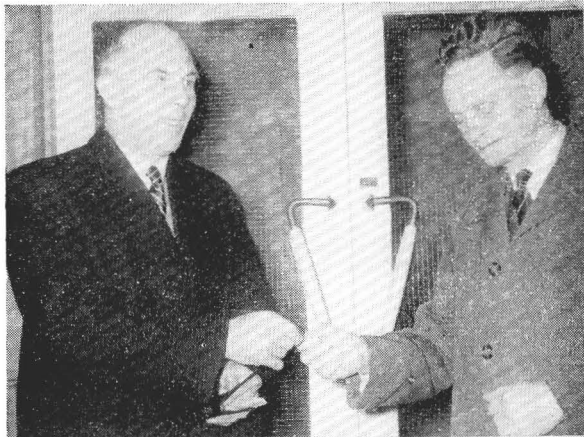
Photo news of the opening of the new church building at Kingstanding

Our readers will know that we have opened an Elim Eventide Home for the aged members of Elim. There is great need of an Aga cooker on the premises and we would be very grateful if interested friends would help us to purchase this for the home. Please send your gifts to: The Secretary, 363 Norton Way South, Letchworth.