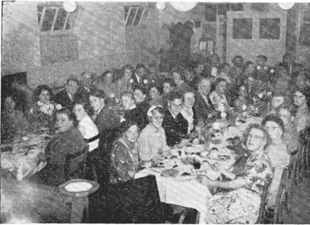
The happy gathering at Rye Park.