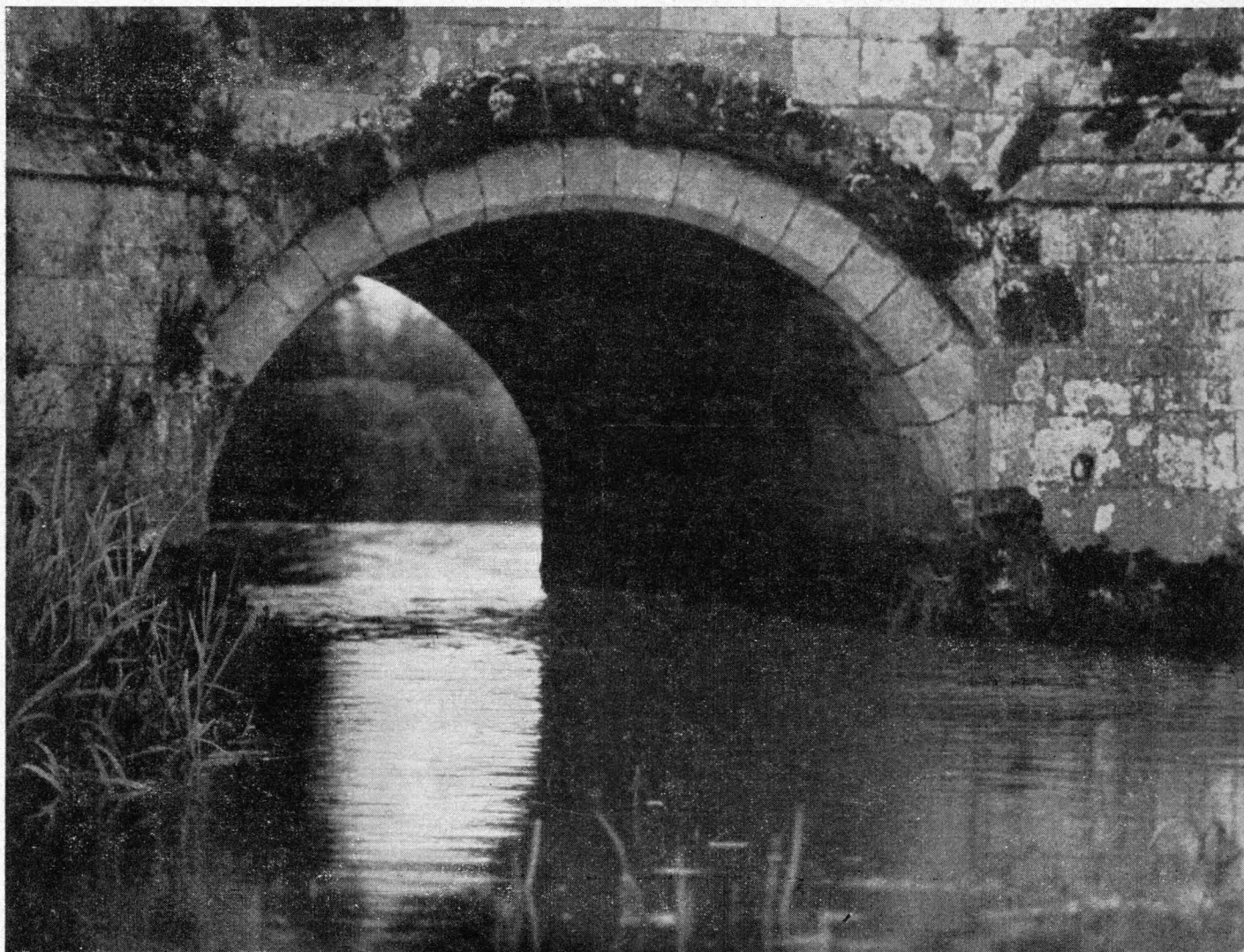
Sunshine in the Shadows

"The light shineth in darkness; and the darkness comprehended it not" (John i. 5).