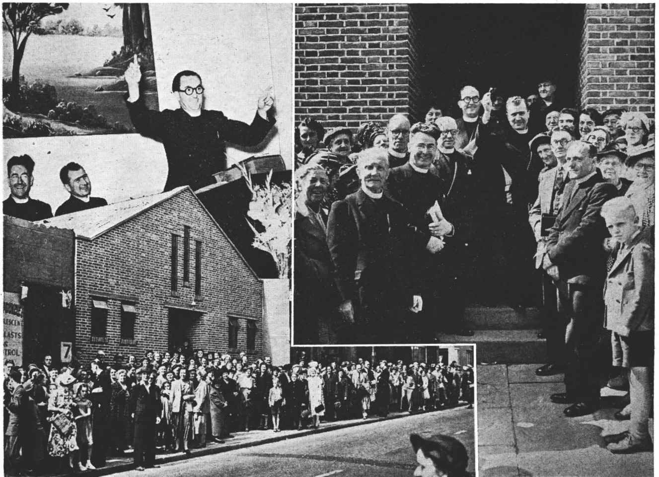
Scenes at the Opening of the new Minor Hall of the Elim Church, Bristol. The main building will be erected as soon as possible.