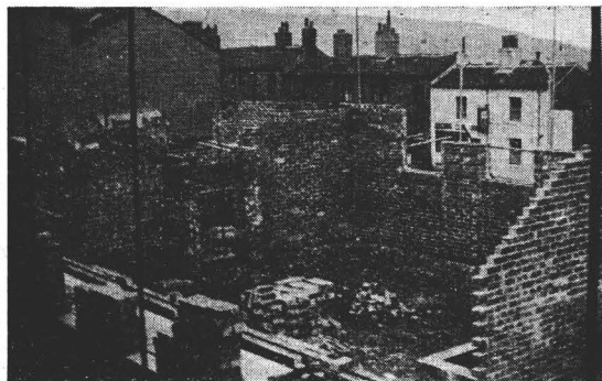
The Elim Church building goes up at Sowerby Bridge.

A recent visit from the Salford trekkers brought abundant blessing, decisions for Christ were made, and to others the day of their Pentecost fully came.