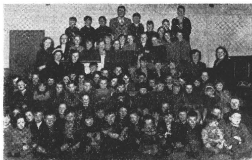
Saunders Street “Sunshine Corner” Group, Belfast

It was heart warming to see youngsters of this needy district keeping up a regular appointment each Monday night to hear the wonderful message of a Saviour's love,