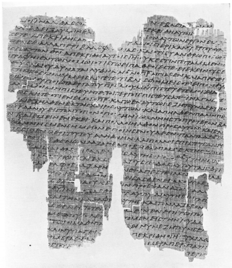
CHESTER BEATTY PAPYRUS I Gospels and Acts, Third Century