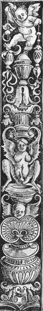
A PAGE FROM ERASMVVS'S EDITION OF THE NEW TESTAMENT, 1516