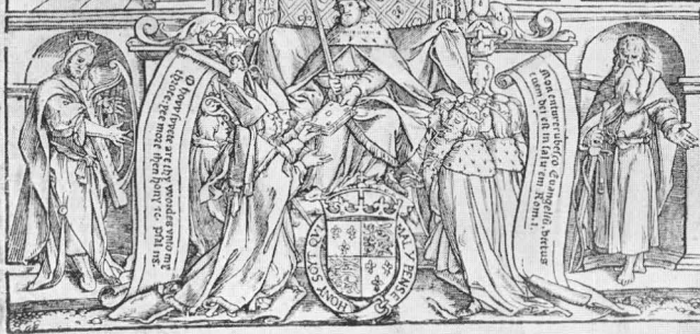
British Museum TITLE-PAGE TO PART I FROM COVERDALE'S TRANSLATION OF THE BIBLE, 1535