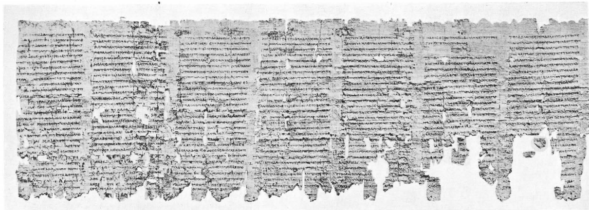
PAPYRUS ROLL Louvre Hyperides