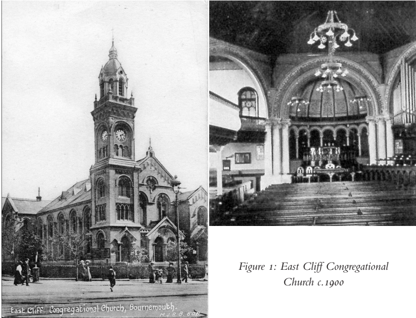
Figure 1: East Cliff Congregational Church c.1900

church enjoyed significant growth, which must have heartened both members and leaders alike.